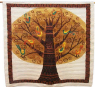
Wool Tree of Life Tapestry by a Peruvian artisan

Visit the Ten Thousand Villages Store for unique Christmas gifts or something special for yourself! Visit the Store as your way of giving to others twice!