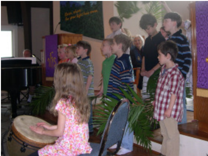
Our children sang a 20th century South African tune on Palm Sunday (translated to Siyahamba in Zulu) while waving and distributing palm fronds to the congregation.